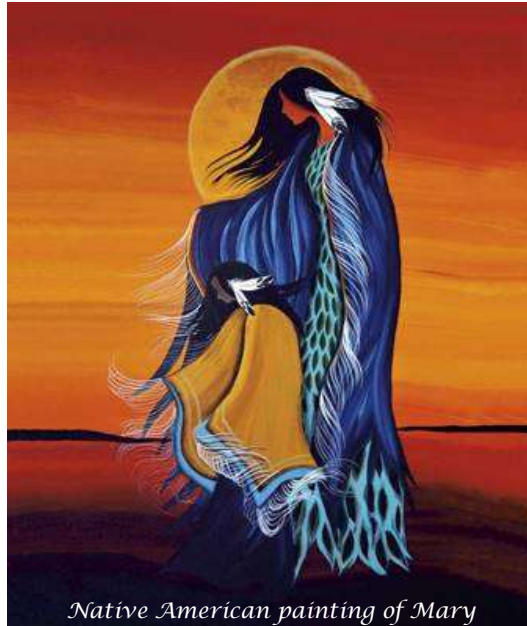
Native American painting of Mary