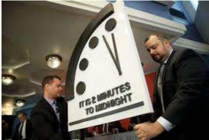
The Doomsday Clock