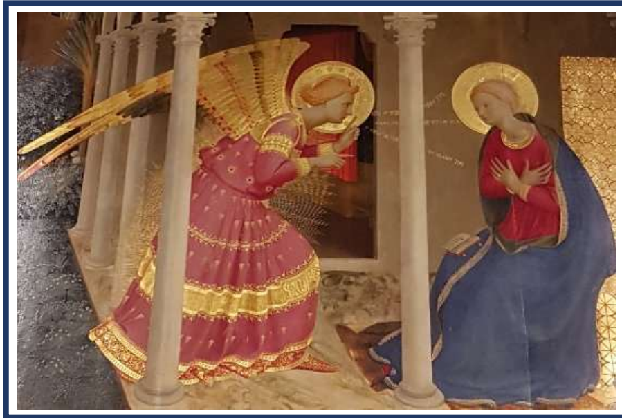
Annunciation by Fra Beato Angelico (1395 - 1455) from The Cortona Altarpiece 1432