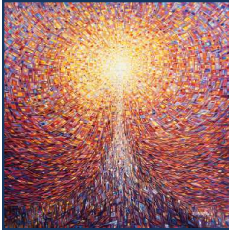
Ascension - eddiecalz